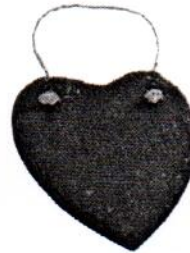
Heart Chalk Slate