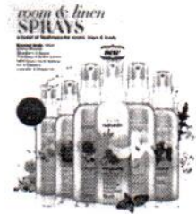
Room, Linen & Body Spray

Larger, colour photos are available to see at school reception.